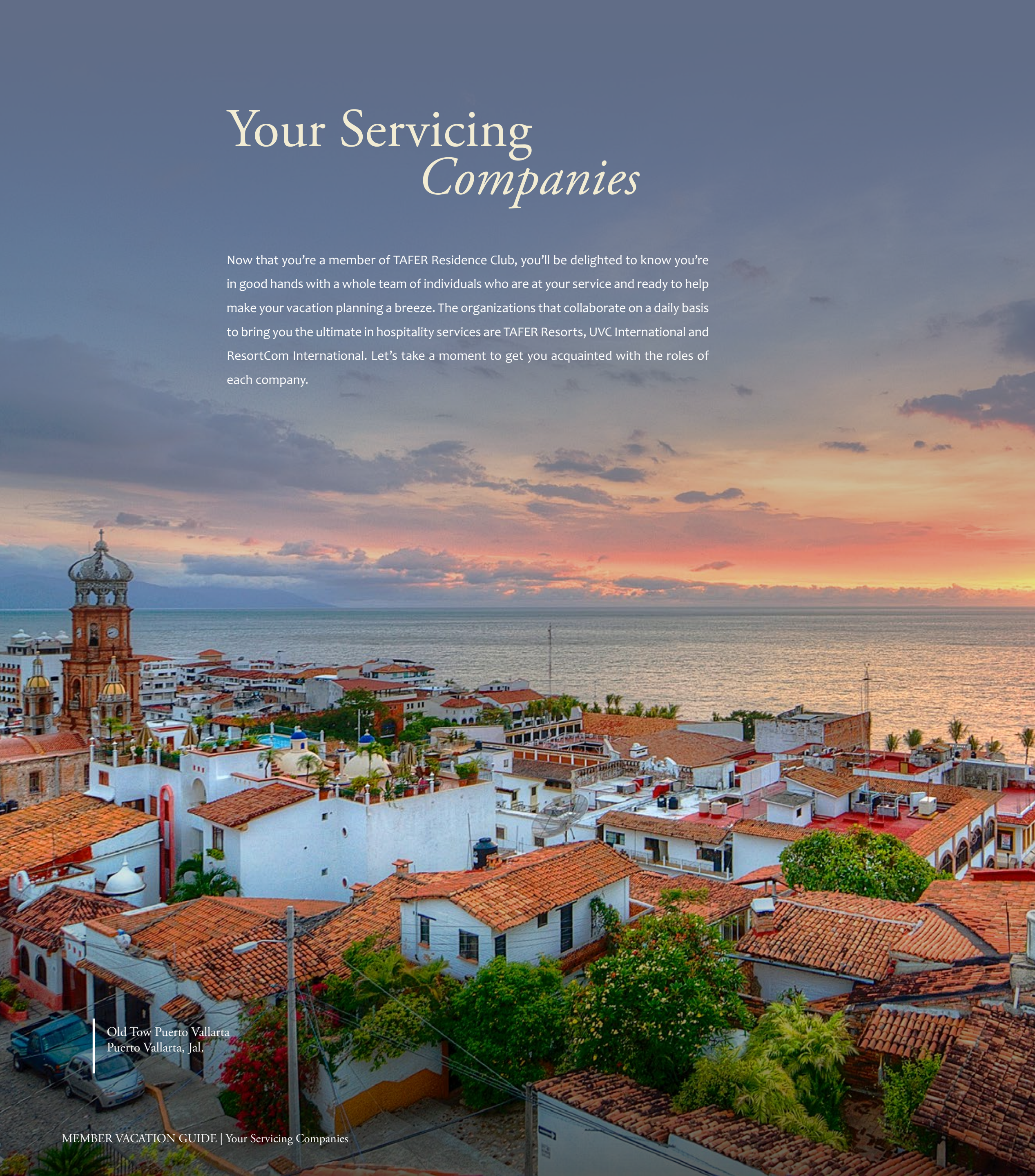
Old Town Puerto Vallarta Puerto Vallarta, Jal.

Now that you're a member of TAFER Residence Club, you'll be delighted to know you're in good hands with a whole team of individuals who are at your service and ready to help make your vacation planning a breeze. The organizations that collaborate on a daily basis to bring you the ultimate in hospitality services are TAFER Resorts, UVC International and ResortCom International. Let's take a moment to get you acquainted with the roles of each company.