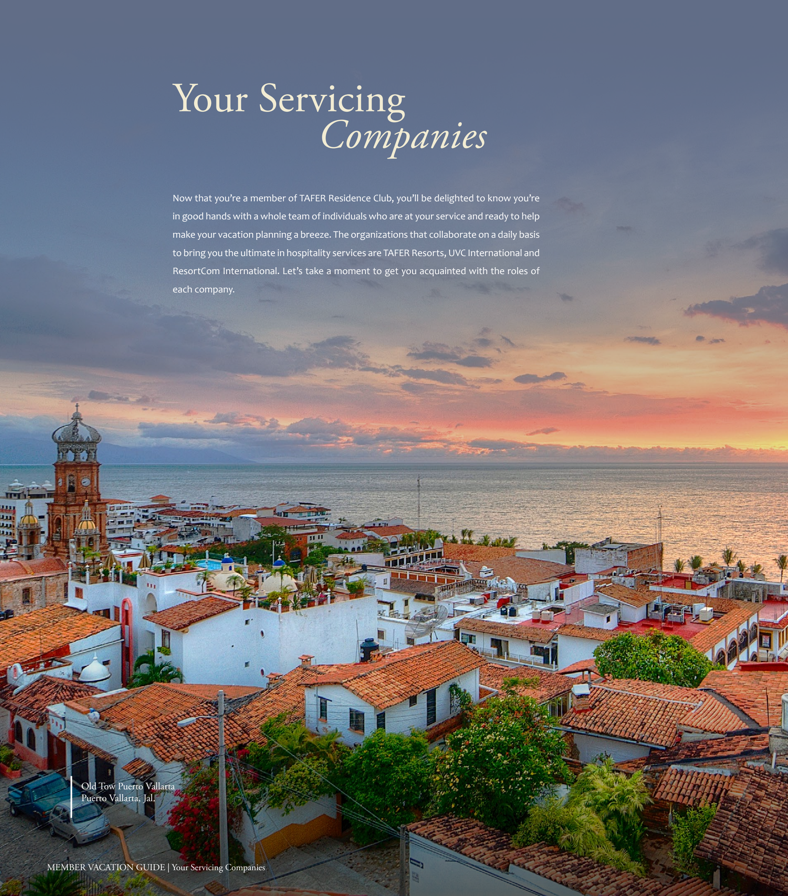
Old Town Puerto Vallarta Puerto Vallarta, Jal.

Now that you're a member of TAFER Residence Club, you'll be delighted to know you're in good hands with a whole team of individuals who are at your service and ready to help make your vacation planning a breeze. The organizations that collaborate on a daily basis to bring you the ultimate in hospitality services are TAFER Resorts, UVC International and ResortCom International. Let's take a moment to get you acquainted with the roles of each company.